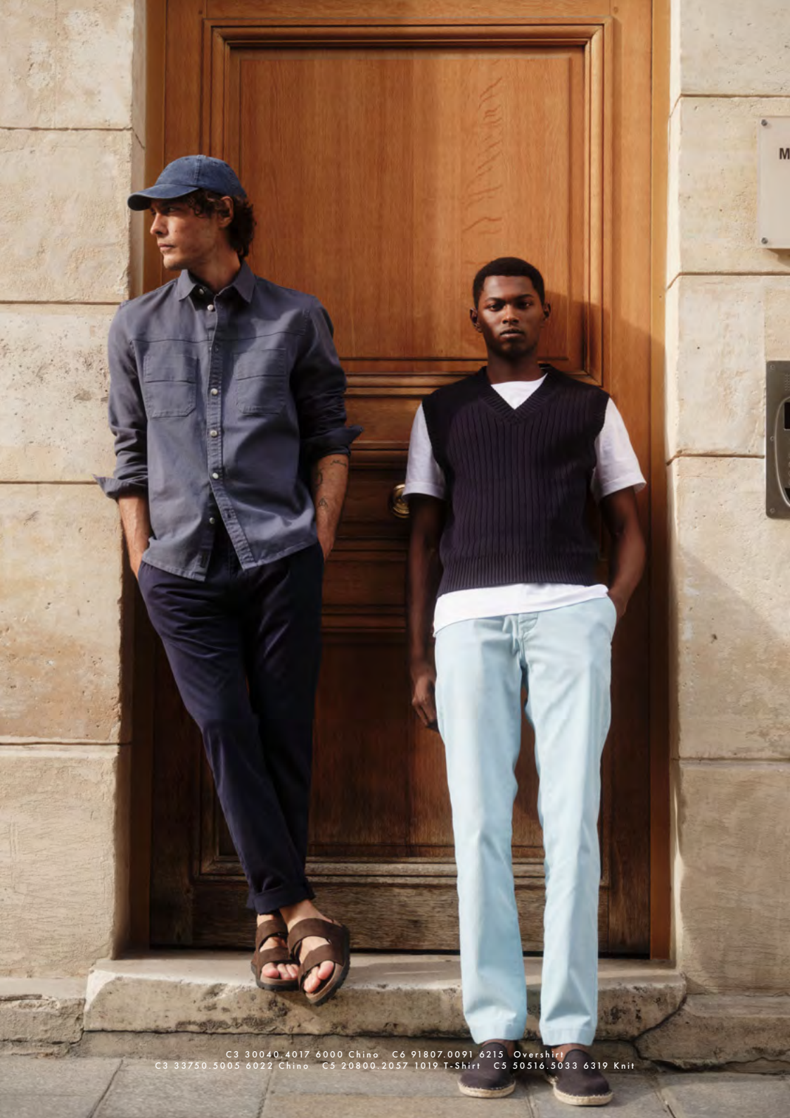
C3 30040_4017 6000 Chino C6 91807_0091 6215 Overshirt C3 33750_5005 6022 Chino C5 20800_2057 1019 T-Shirt C5 50516_5033 6319 Knit