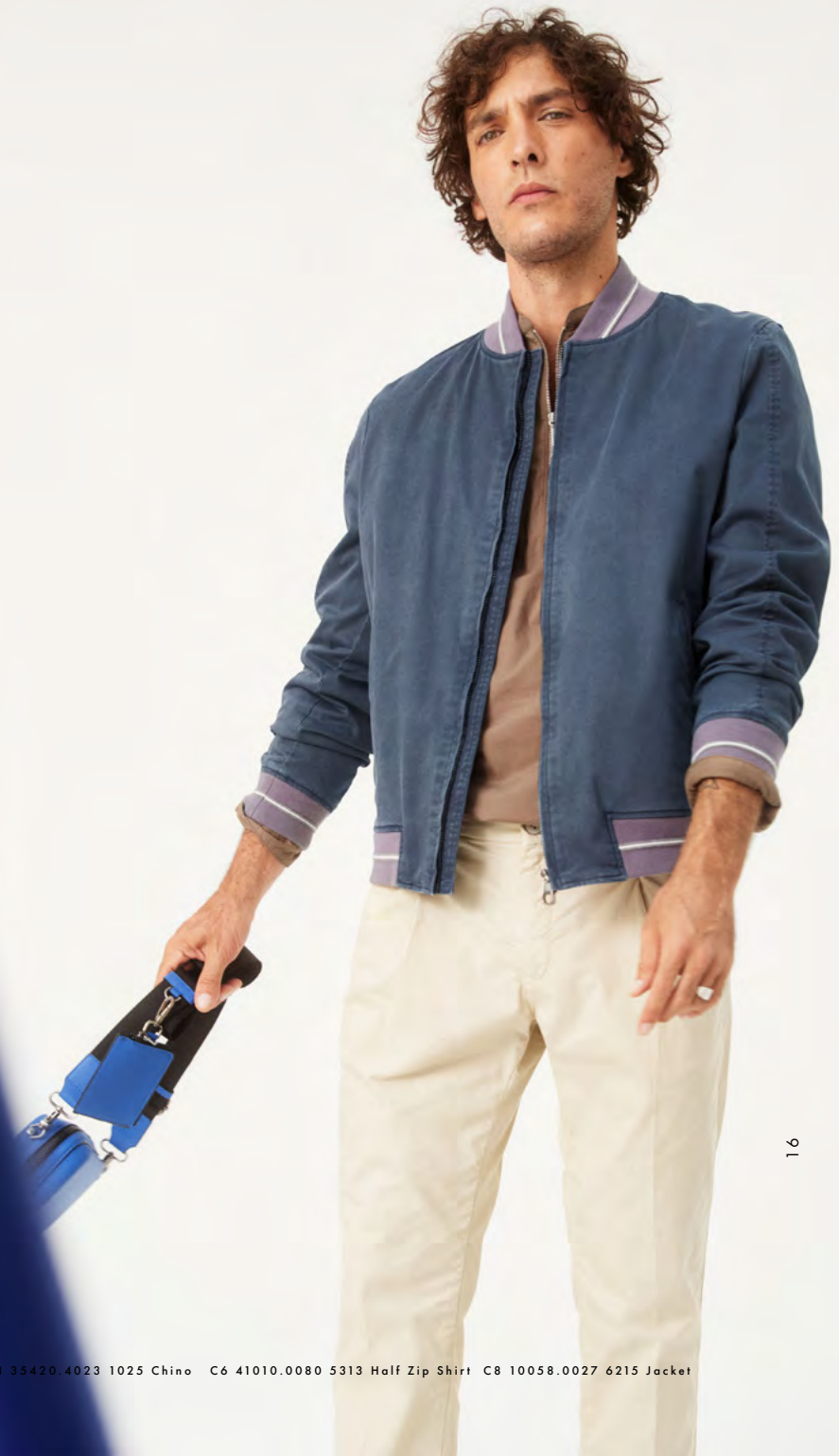
C3 35420.4023 1025 Chino C6 41010.0080 5313 Half Zip Shirt C8 10058.0027 6215 Jacket