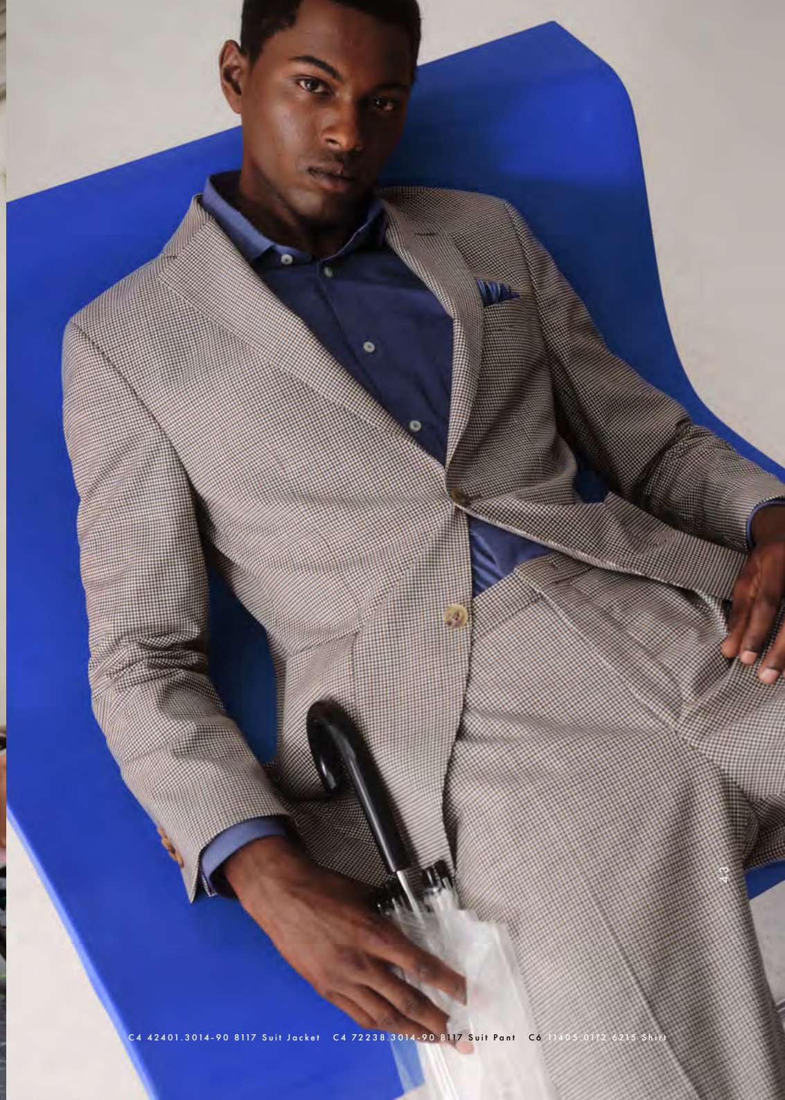
C4 42401.3014-90 8117 Suit Jacket C4 72238.3014-90 8117 Suit Pant C6 11405.0112 6215 Shirt