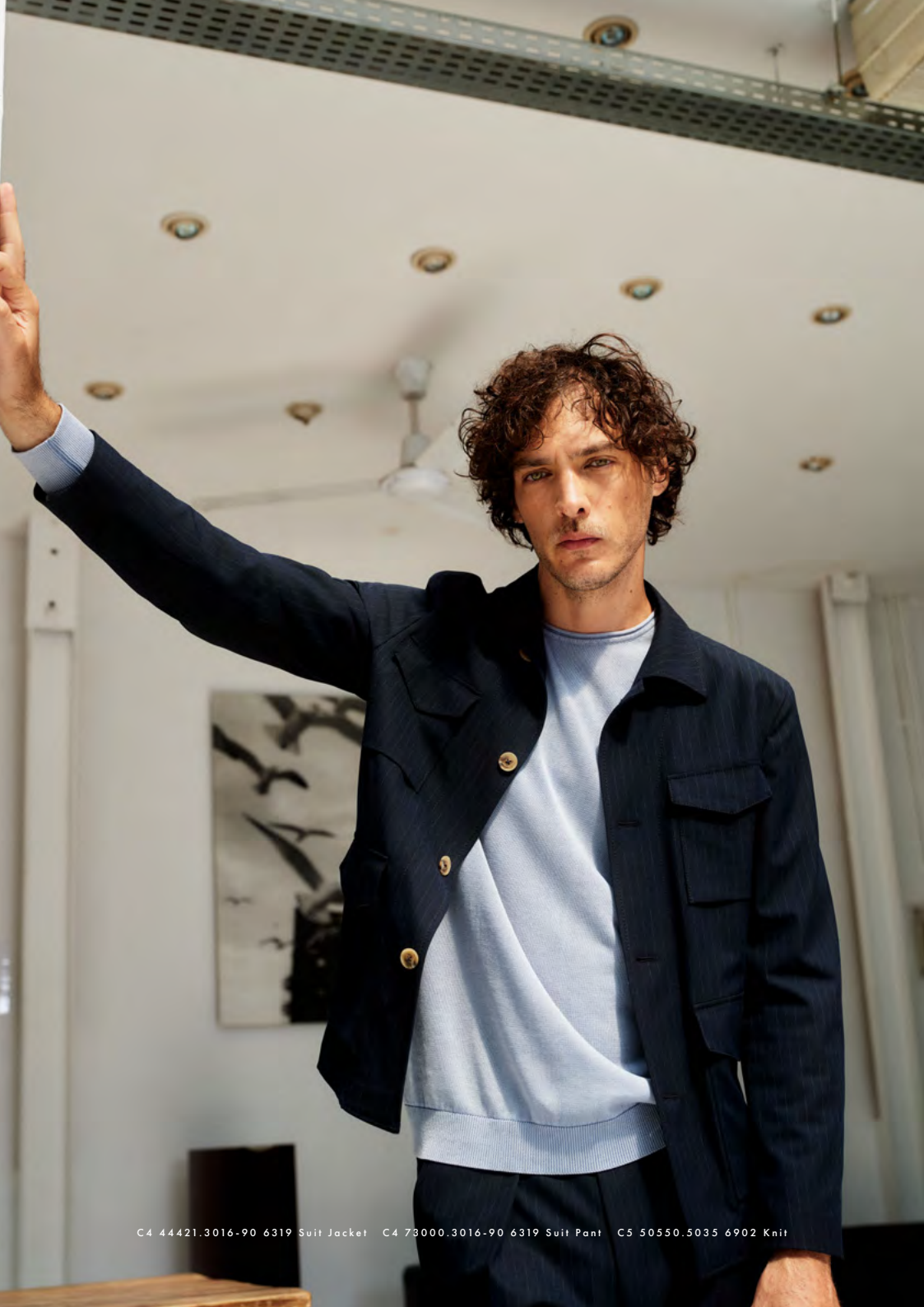
C4 44421.3016-90 6319 Suit Jacket C4 73000.3016-90 6319 Suit Pant C5 50550.5035 6902 Knit