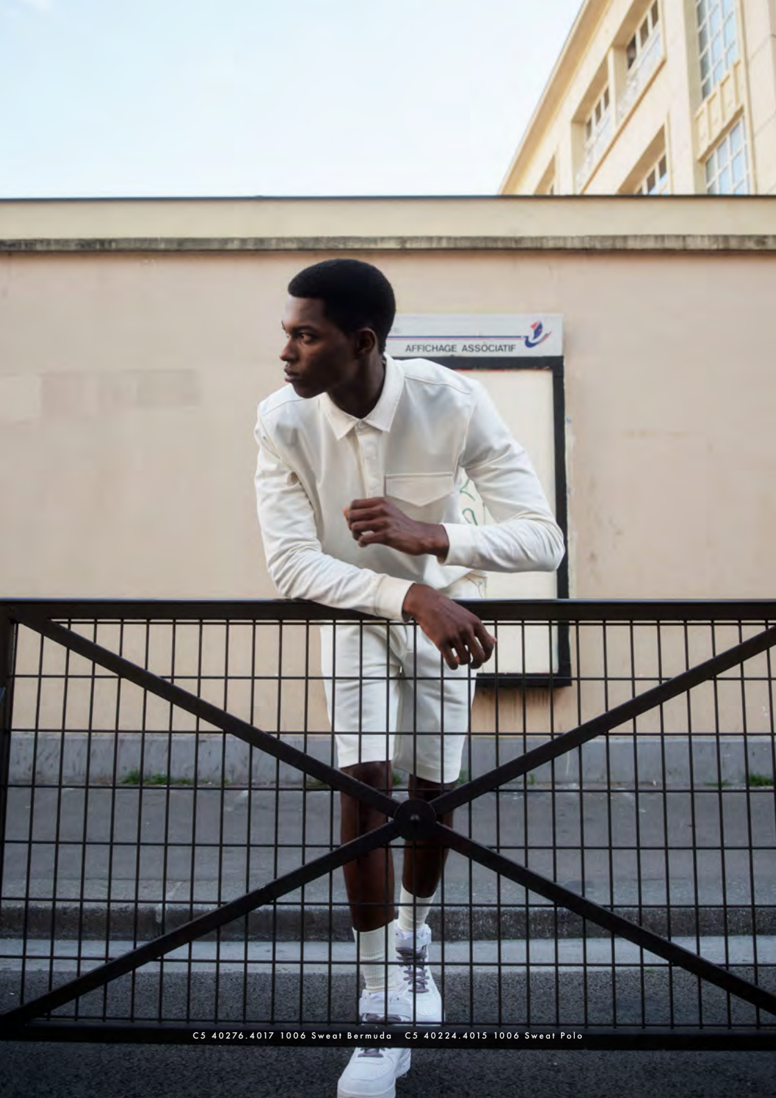
C5 40276.4017 1006 Sweat Bermuda C5 40224.4015 1006 Sweat Polo