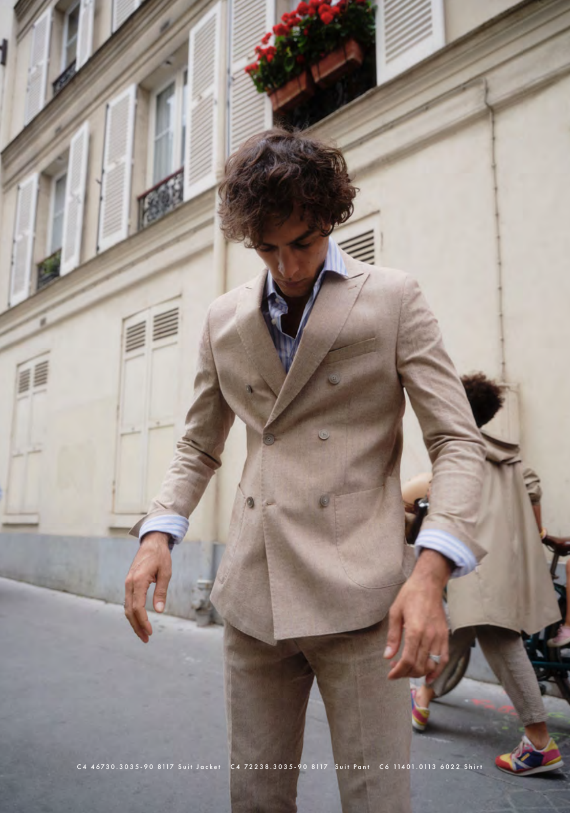
C4 46730.3035-90 8117 Suit Jacket C4 72238.3035-90 8117 Suit Pant C6 11401.0113 6022 Shirt