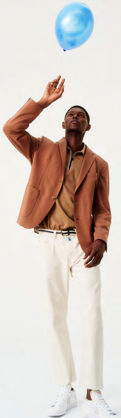
C7 34510.8066 1003 Denim C5 20685.2050 8117 Polo C4 42404.3050-90 8119 Suit Jacket